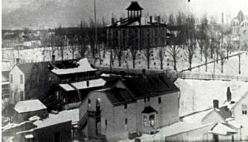
View from the Winchester Hotel

Then, more and more traveling men began stopping at hotels down town to avoid carrying their luggage up the big hill; by 1912, it had become a losing proposition.