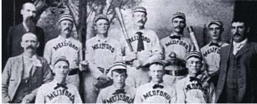
The Baseball Team