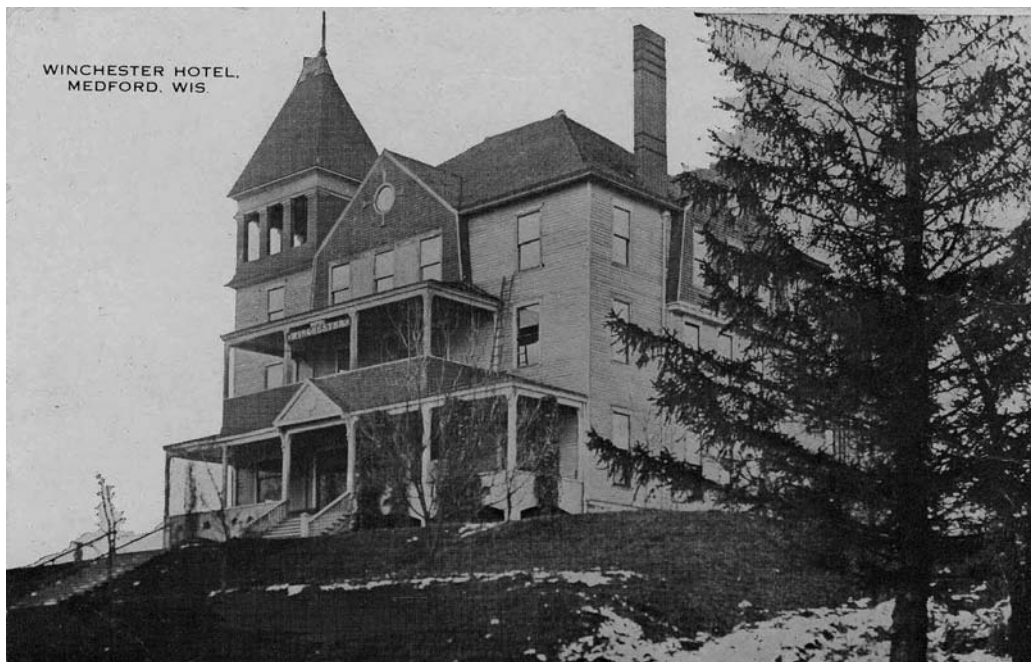
Picture of Winchester Hotel