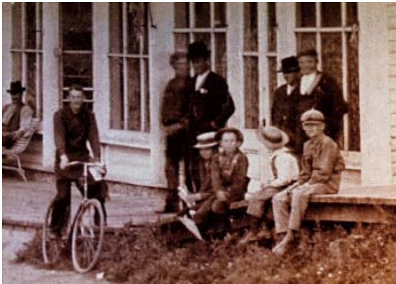
A Wooden Sidewalk on Medford's Main Street

In 1920, it was sold to District Superintendent Kundert who had it razed, the lumber and material being sent to build churches and parsonages all over northern Wisconsin. The local Methodist church was built with lumber from that hotel." (Latton, pp. 108-109)