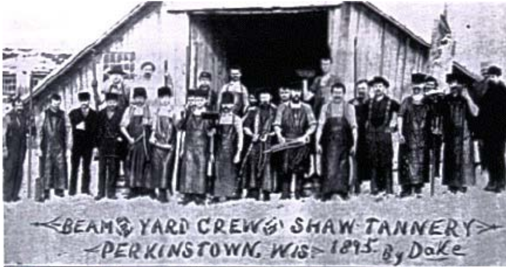
Beam and yard crew in Shaw Tannery