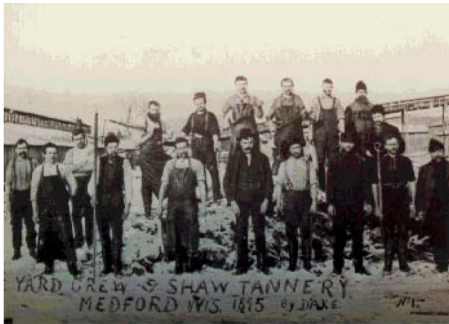
Yard Crew of the Shaw Tannery in Medford, Wisconsin in 1895