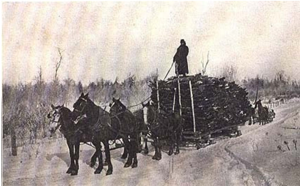
Hauling Hemlock Bark

In 1893, Shaws built a tannery on the north side of Rib Lake. Later they built other tanneries in Prentice, Phillips, and Mellen.