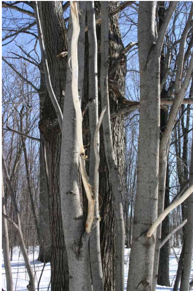
Tall Old Basswood Tree Surrounded by New Young Trees

Basswood trees that grow among others in a forest may grow tall and thin. When the main trunk begins to decay or is cut, new sprouts arising at the bottom may create a tree with many trunks.