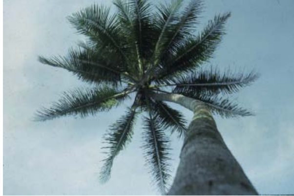
Loretta Kuse took this photo of a Coconut Tree in New Guinea by looking from its base on up the trunk.

Look at pictures of “The Lawrence Tree” painted by Georgia O’Keefe. She painted it from below and looking up into the night sky. What might the Basswood tree look like in a drawing if you viewed it from lying on the bench beneath it? Find other images of trees painted by O’Keefe.