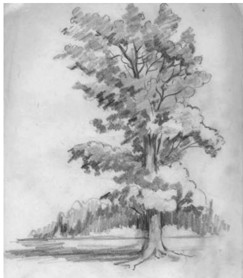
Tree by Walter Kuse

Note how the awareness of light and shadows enhanced this drawing. From which perspective or angle did the artist draw the tree?