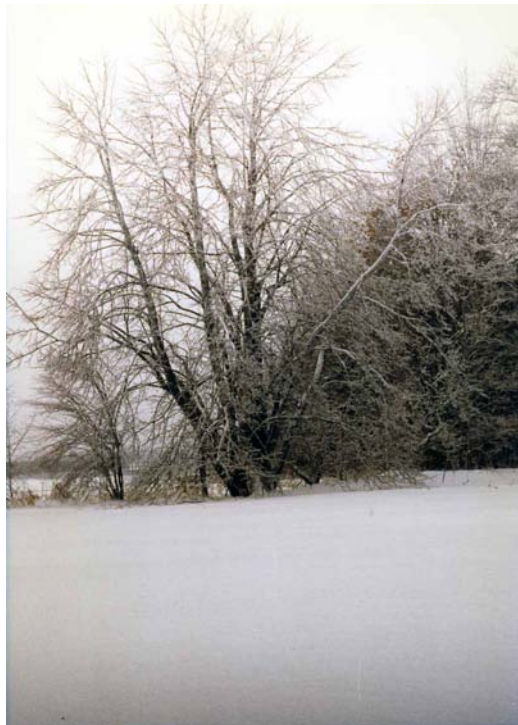
Basswood Tree with Many Trunks

What is the basic shape of the basswood tree at Bench Q? Look at a picture of it taken in winter.