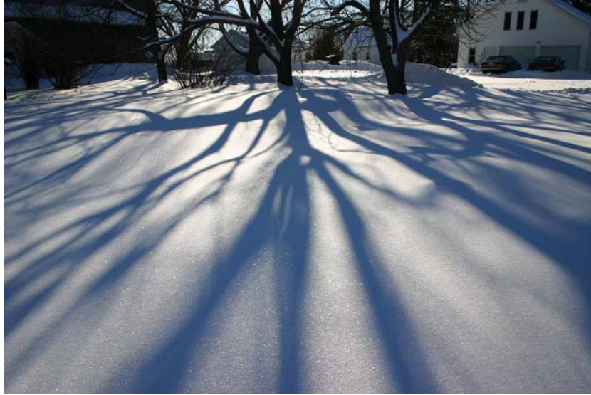
Shadows Cast on the Snow by Trees in the Kuse Yard

Look at shadows that trees cast on a sunny day or in bright moonlight. How is the shape of the shadow like the shape of the tree? Why might the shadow be long or short? Find pictures of shadows of trees in photographs or paintings.