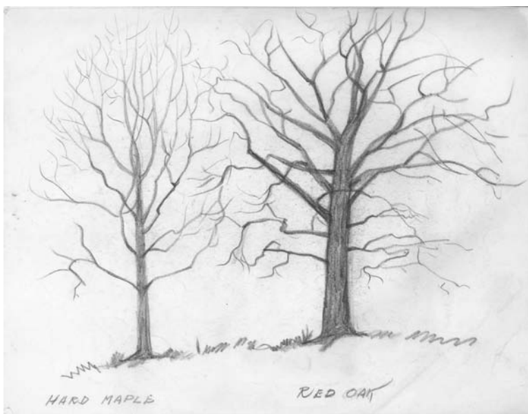
Pencil Sketch by Walter Kuse

Look at the shapes of different kinds of trees in tree identification books. Scientific illustrators need to try to make their drawings look like real trees. How does the shape help you know what kind of tree it is?