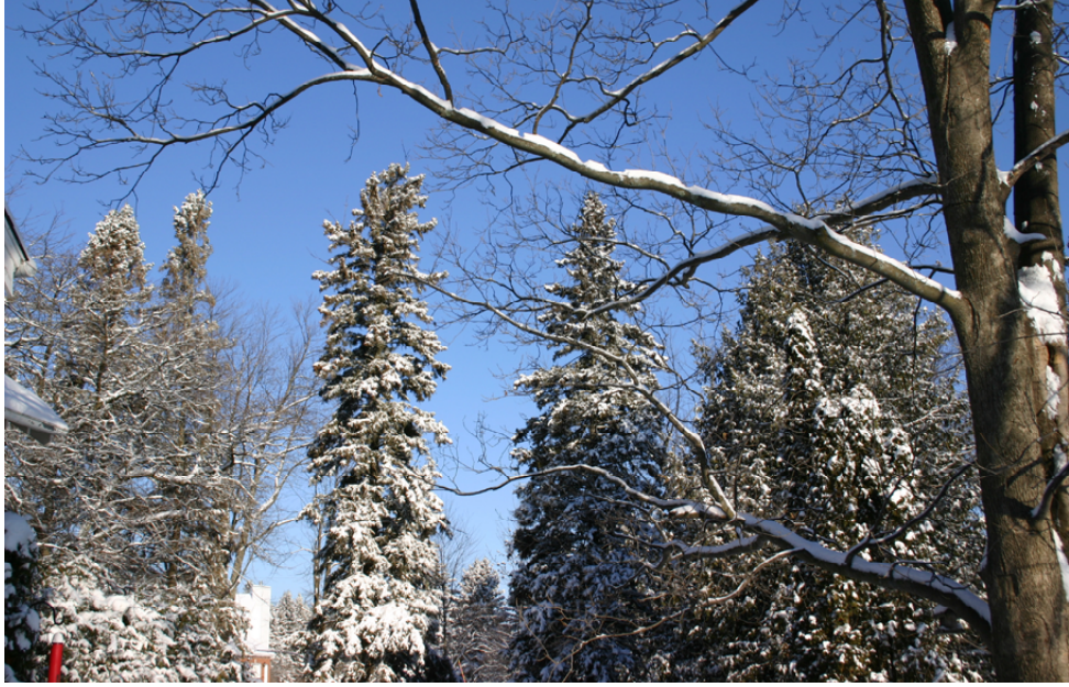
Black Hill Spruce Trees