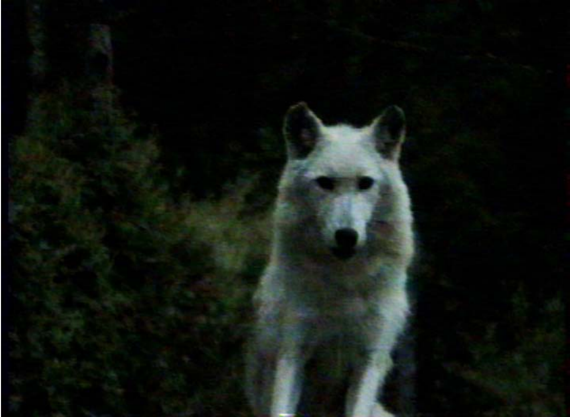
Photographed in Northern Taylor County

Wolves have been seen throughout Taylor County. We have not seen them in the Kuse Nature Preserve.