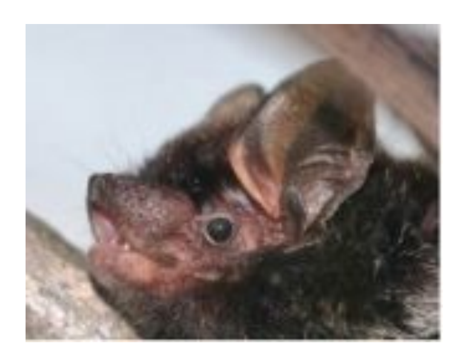
Head of Silver-haired Bat