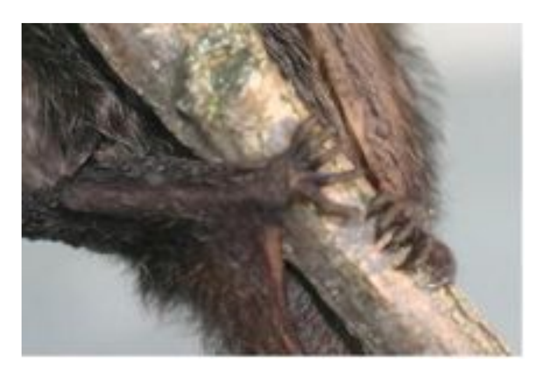
Feet of Silver-haired Bat